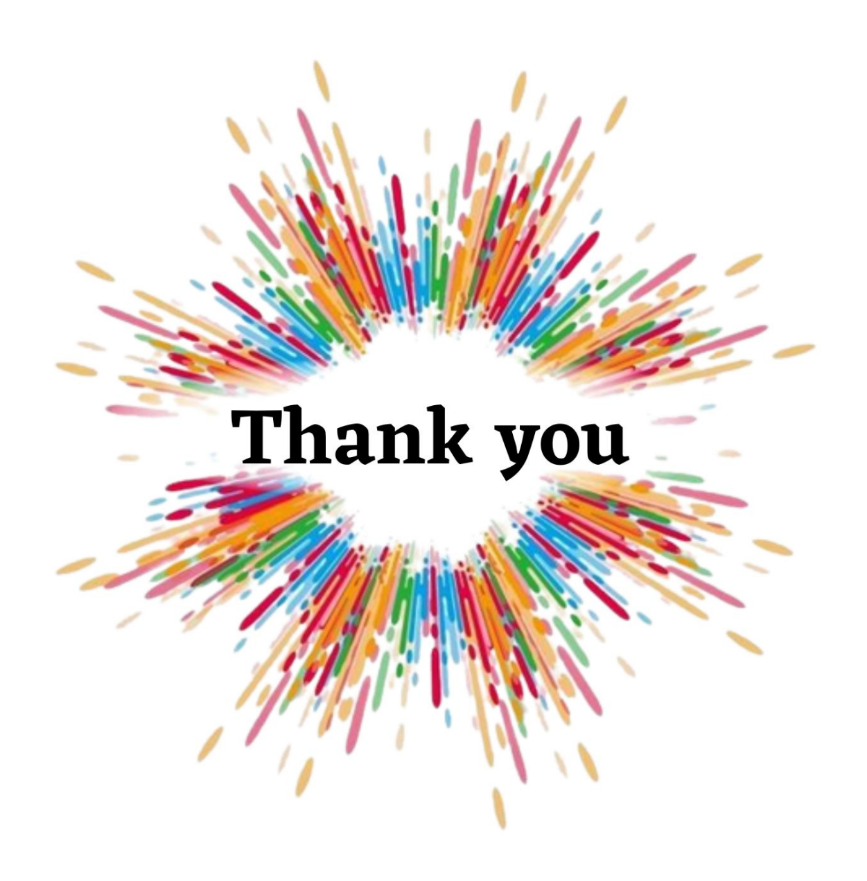
To all children, parents, monitors & volonteers!