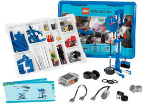
Future in the making

Your Child's Future Starts Now with the STEAM Workshop (Science, Technology, Engineering, Arts and Math). Based on latest studies on the future of work, this program is designed to help children better prepare for the uncertain challenges. Our small-group, hands-on, problem-solving approach makes science education fun yet challenging. The program will cover a broad range of "Science Essential" Concepts, such as forces, motion and energy using specialized LEGO sets to model real world behaviors, all while encouraging critical thinking, experimentation and investigation skills.